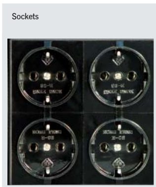
PDG 400 - PDG 600